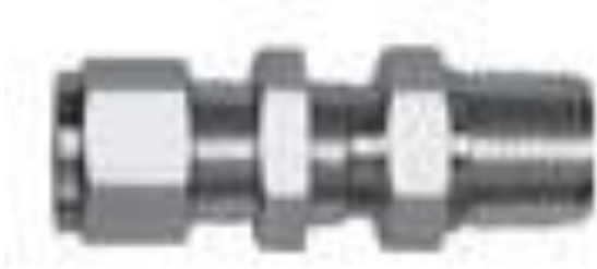
Dimensional Details :