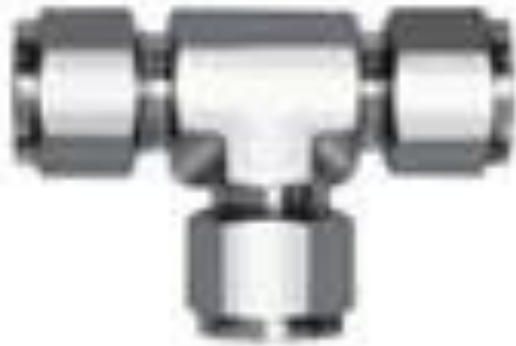
Dimensional Details :